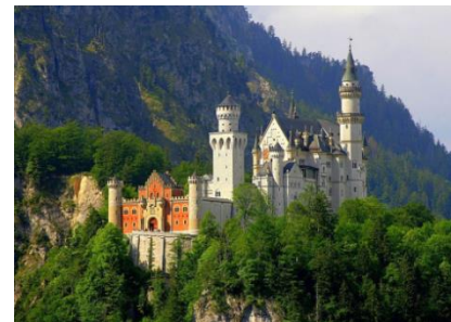
Regensburg, Munich, Mountain Zugspitze, Castle Neuschwanstein, Castle Katz and Loreley

We will discover the world heritage Upper Middle Rhine with its castles and vineyards, Trier with its roots as roman city, the Mosel valley, Heidelberg with the famous castle and Speyer with the cathedral on day trips from our hotel in Mainz . Highlights will be a wine tasting in the Abbey of Eberbach and a knights dinner on the castle of Marksburg . We will visit Cologne using the high speed train ICE. Frankfurt will be our last city.