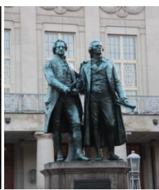
Trier (Porta Nigra), Martin Luther, Weimar, Frankfurt Skyline, Regensburg

period of the Classicism and persons like Goethe and Schiller in Weimar , and finally the modern Germany in cities like Frankfurt and Berlin .