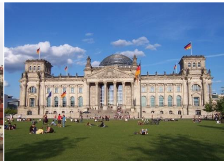
Colosseum Rome, Zugspitze, Hradschin Prague, Parliament Berlin, Geiranger Fjord Norway

We will continue our journey with the baroque city of Dresden heading afterwards towards Berlin . The plain of northern Germany will be passed on the way to Hamburg where we will check in on our cruise on the North Sea. We will reach the North Cape , the most northern point of the European mainland, with an intermediate stop in Aalesund. We will visit the fascinating world of the Norwegian Fjords during our way back to Amsterdam and Hamburg.